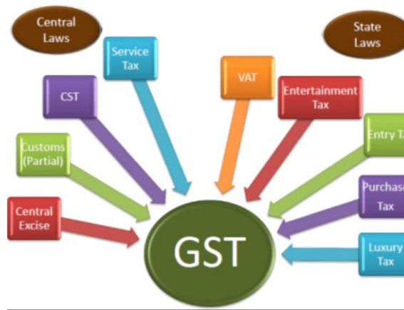
Figure 1 GST

GST would have momentous effect in transit individuals, retailers and business worries in India. The majority of the industries, GST tax chunk rate have been expanded dependent on the diverse criteria which would be extensively affected by GST is the automobile, insurance and retail sector. The present examination has assumed greater liability to investigate the customers' perception on GST and it likewise depicts the advantages and disadvantages of the GST system in India.