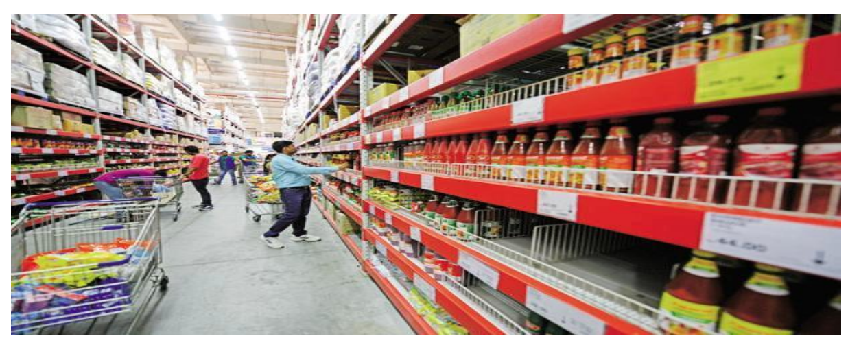
Fig 6: Departmental store with dearer goods

The tax rates on all the daily need items were come down after implementation of GST compare to VAT rates.