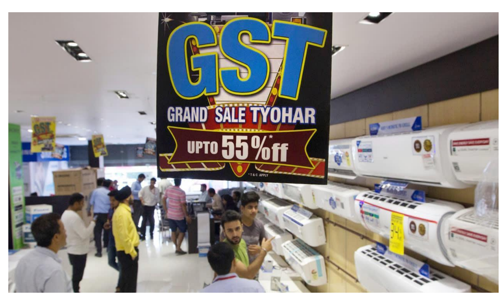
Fig 7: A shop with consumer durables

The tax rates on movie tickets and five star restaurants has increased around 5-6 percent and on air tickets economy class has a little decrease